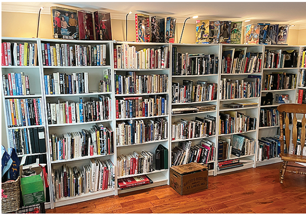
This is about a third of my home reference library.

in 17 bookcases in the two-room suite where I build my Further Review pages. I have three entire bookcases on U.S. history. Two entire bookcases on political science. Two entire