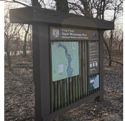
Photo: Take your photo next to the single panel info board. This location has a fishing pier and accessible bank fishing opportunities.

GPS Coordinates: 42.07071680531984, -90.12533889047758