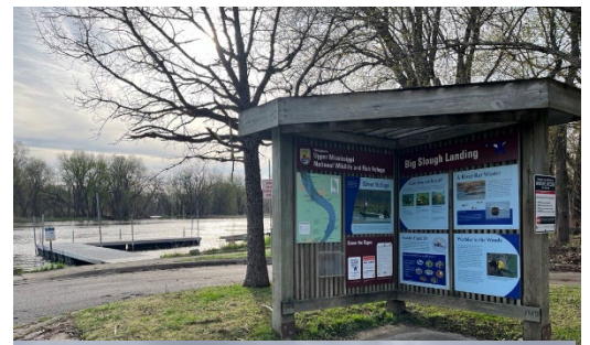
Photo: Take your picture next to the two panel kiosk located next to the boat ramp. This site has a long fishing pier and great access.

GPS Coordinates: 43.36718829199579, -91.20835490425995