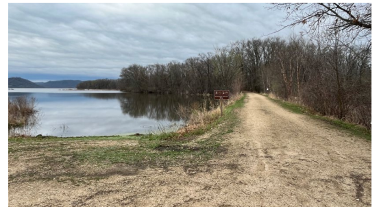
Photo: Take a picture with the with the three-panel kiosk and the wetland view in the background!