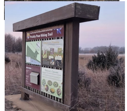
Photo: Take your photo next to this information board. This trail winds through prairie and a short walk will lead you to an overlook on the river.

GPS Coordinates: 42.18282038654205, -90.2524845935209