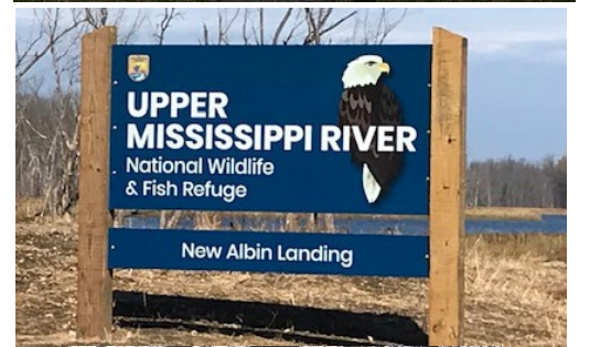
Photo: Take your photo next to the blue bald eagle sign at the boat landing. This is a great spot for wildlife viewing of all kinds!

GPS Coordinates: 43.49226212488441, -91.24889815586866