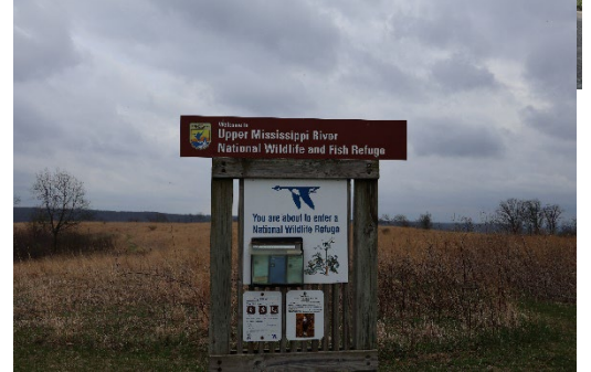
Photo: Take a photo next to the single panel info board with the scenic views of the bluffs behind you. This trail winds through a blufftop prairie with sweeping views of the river.

GPS Coordinates: 42.97105975541485, -91.17146235682091