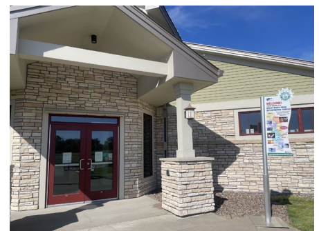
Photo: Celebrate our partnerships and take a photo with the Great River Road sign located outside in front of the Visitor Center. Stop by the Visitor Center to enjoy about 2.5 miles of trails winding through a restored sand prairie! Look and listen for dickcissels, meadowlarks and clay-colored sparrows.