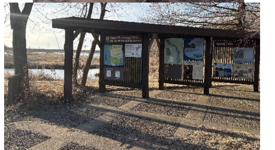
Photo: Take your picture next to the 3 panel kiosk. This is a popular place to view birds during the spring and fall migration.

GPS Coordinates: 42.06478758203184, -90.12605041771093