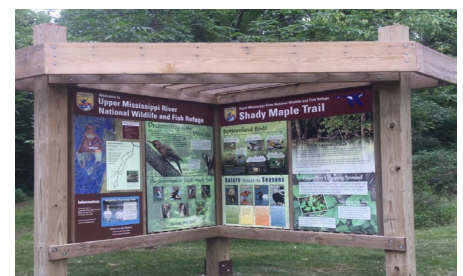
Photo: Take a picture with the two-panel kiosk located at the trailhead!

GPS Coordinates: 43.726664182399894, -91.2145700350287