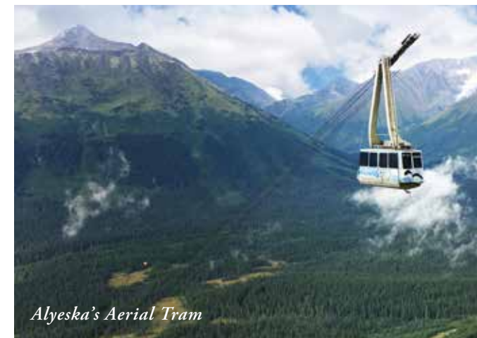
Alyeska's Aerial Tram

Travel along fjord-like Turnagain Arm, on one of the most beautiful stretches of highway in Alaska. Enjoy picture postcard views as we head for the Alaska Wildlife Conservation Center, a sanctuary dedicated to preserving Alaska's wildlife. Enjoy a special Welcome Lunch and tram ride at Alyeska Resort nestled in the Chugach Mountains. Watch for eagles and moose as we return to Anchorage to enjoy time at your leisure. MEAL L