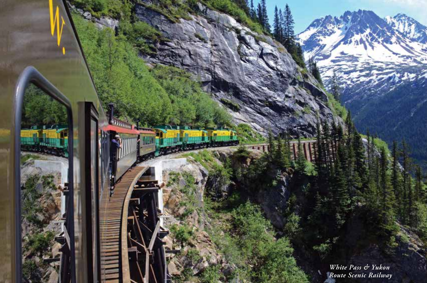
White Pass & Yukon Route Scenic Railway