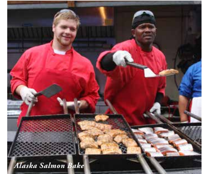
Alaska Salmon Bake