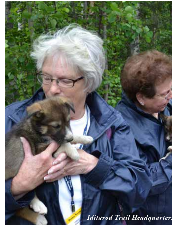
Iditarod Trail Headquarters