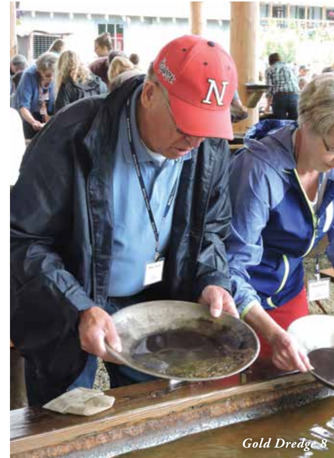
Gold Dredge 8