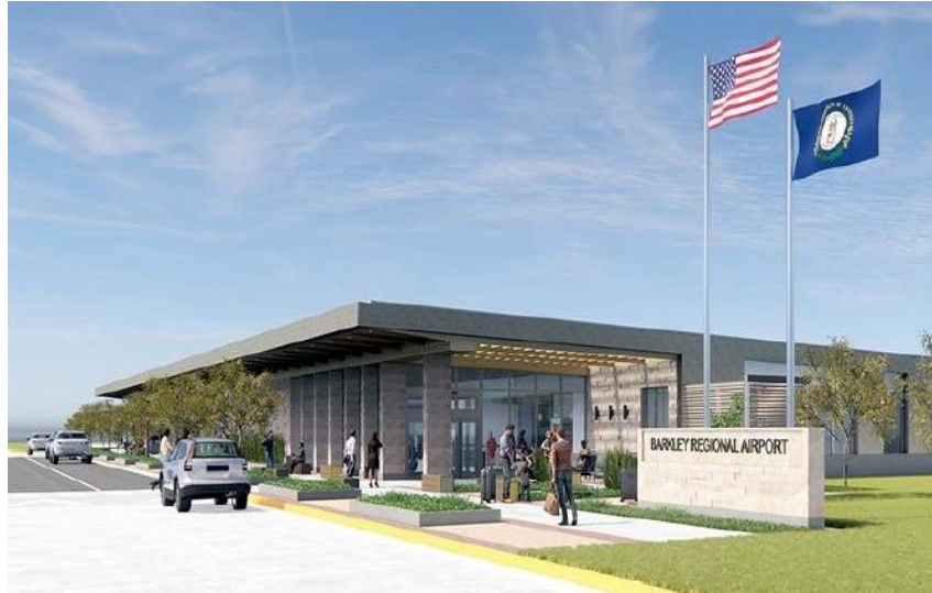
Artist renderings of new Barkley Regional Airport Terminal

A groundbreaking is expected to be held this fall for the construction of a new terminal for Barkley Regional Airport. The Paducah-McCracken County community, the Paducah Chamber and the four state region served by the airport are appreciative of the support received from the Federal Aviation Administration to assist with funding this project. The assistance from FAA helped launch our efforts to also secure funding from the Commonwealth of Kentucky and both the local city and county governments.