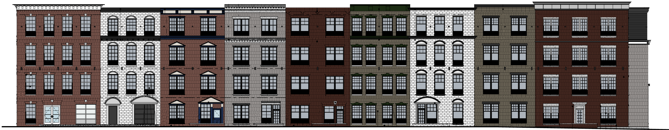
(A) ENLARGED WEST ELEVATION SCALE: 1/8" = 1'-0"