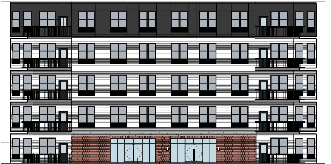
C ENLARGED COURTYARD ELEVATION - WEST SCALE: 1/8" = 1'-0"