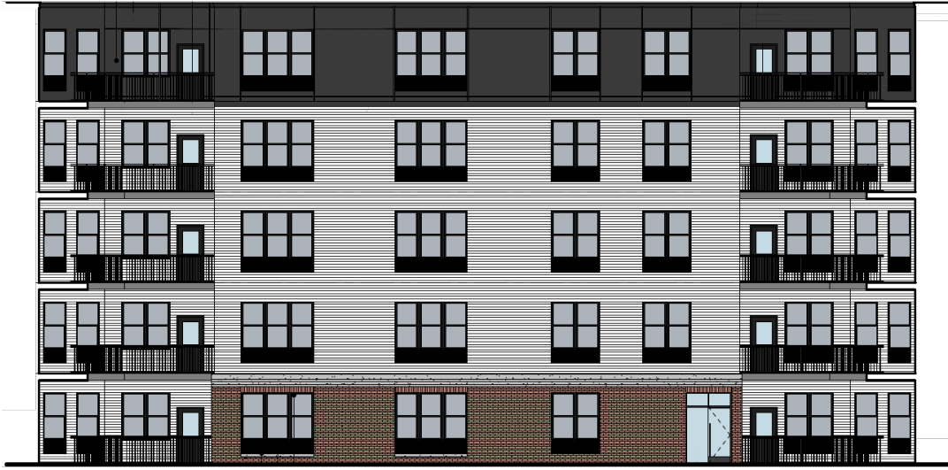
A ENLARGED COURTYARD ELEVATION - EAST SCALE: 1/8" = 1'-0"