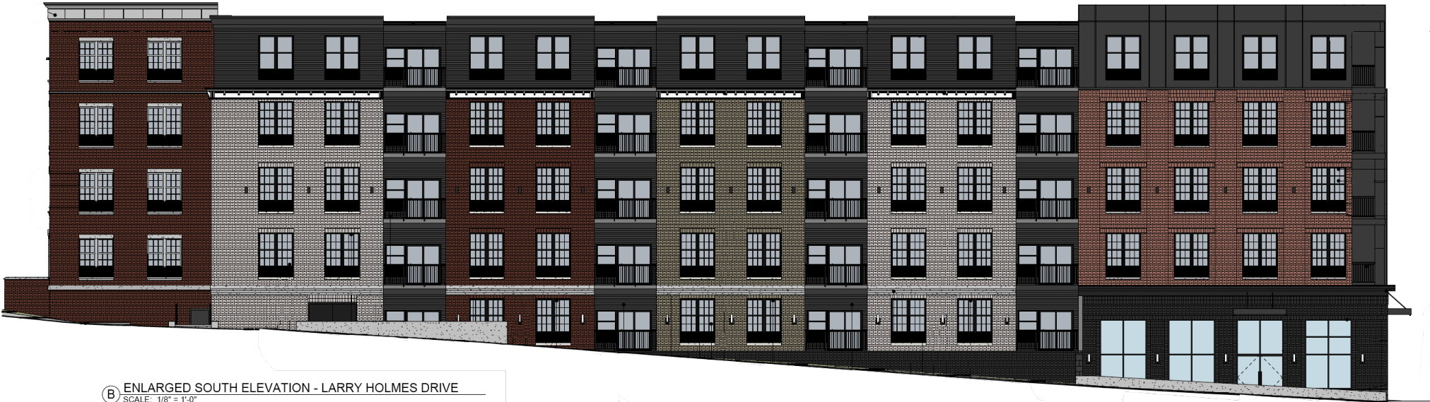
(B) ENLARGED SOUTH ELEVATION - LARRY HOLMES DRIVE SCALE: 1/8" = 1'-0"