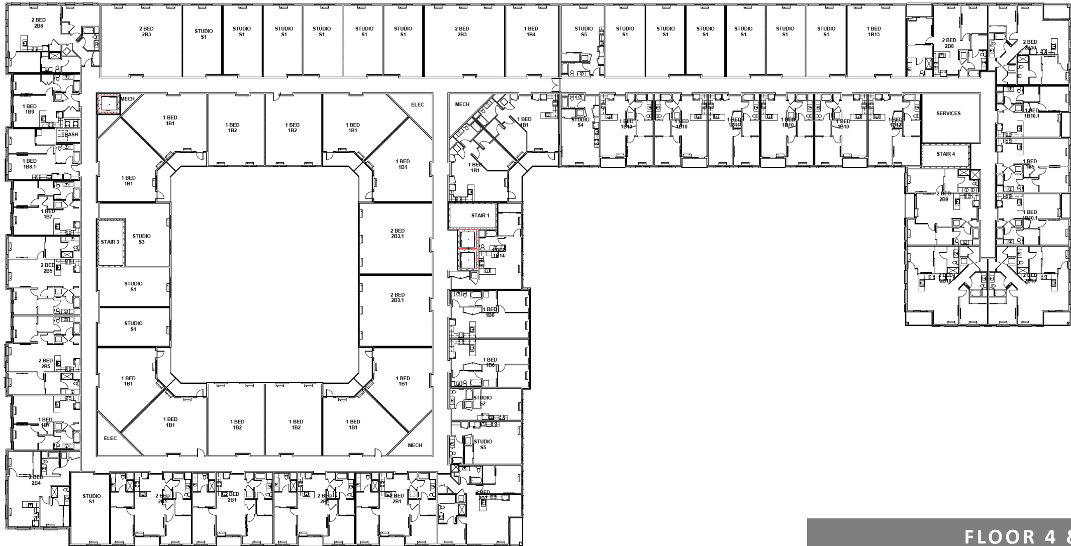
FLOOR 4 & 5 PLAN