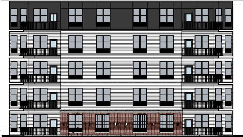
B ENLARGED COURTYARD ELEVATION - SOUTH SCALE: 1/8" = 1'-0"