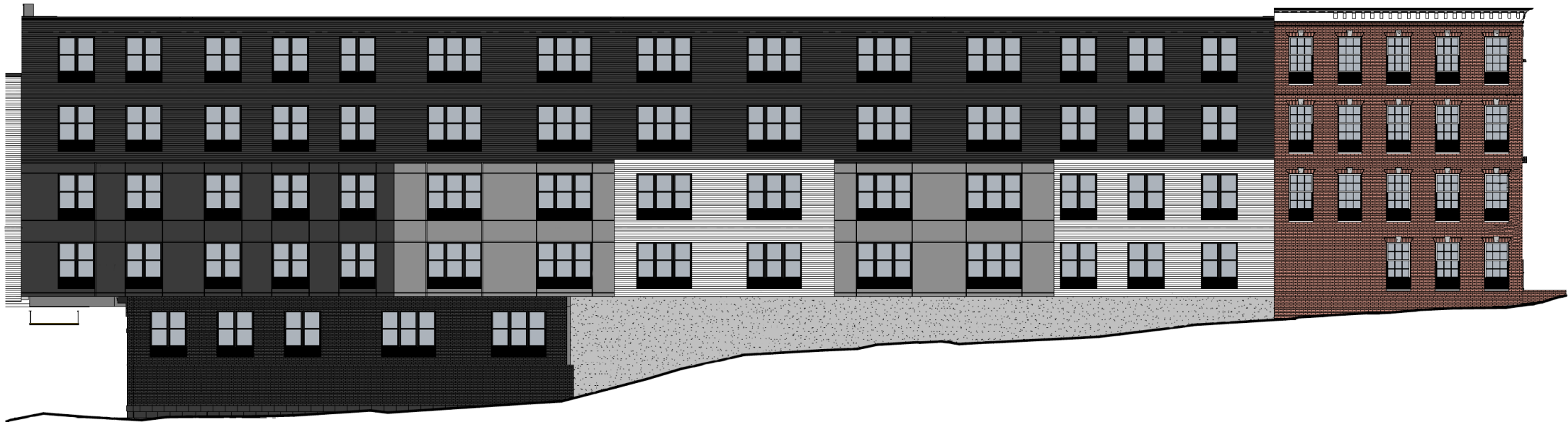
(B) ENLARGED NORTH ELEVATION SCALE: 1/8" = 1'-0"