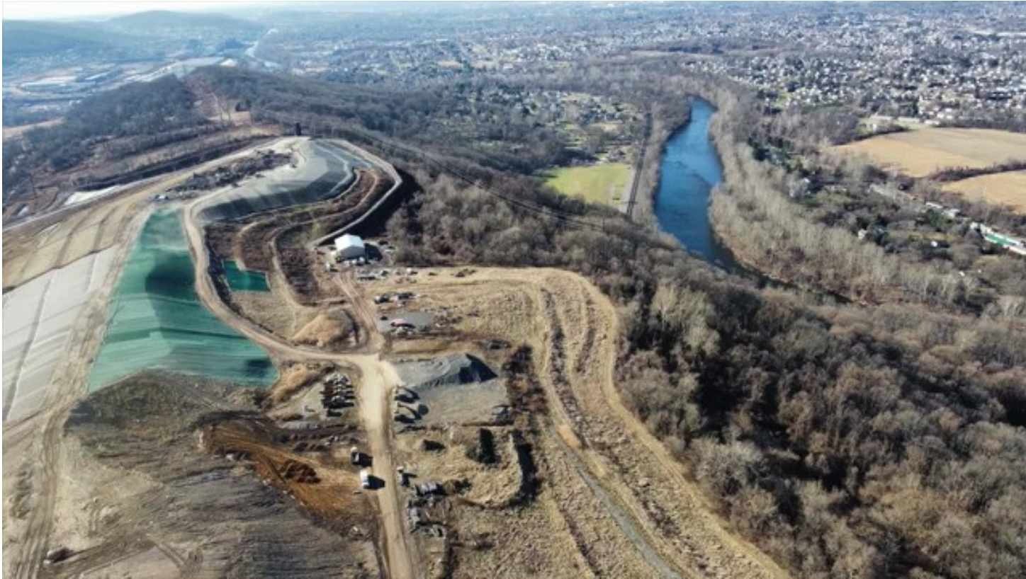
Aerial view of landfill, facing west. The forested area near the bottom right corner is a partial view the proposed expansion area.