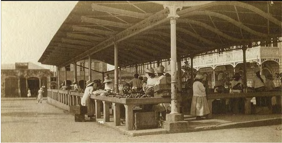
St. Thomas Market Place Square, Circa 1936.

Rico and its U.S. Citizens differently from a state, so long as there was a “rational” basis for doing so. Indeed, it is hard to conceive of a law that has no rational basis, no matter how unfair, and it also gives very wide discretion to Congress.