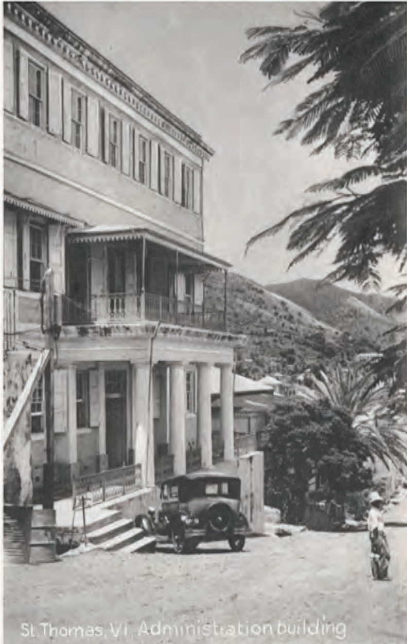
Government House, St. Thomas. (circa 1954)