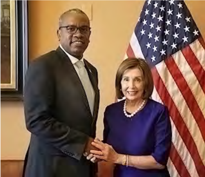
Governor Albert Bryan, Jr. met with U.S. House of Representatives, Rep. Nancy Pelosi (D-California) to discuss U.S.V.I. issues. (October 2019, Government Archives)

United States Courts, and matters relating to the U.S. Attorney and the U.S. Marshal are under the supervision of the Attorney General.