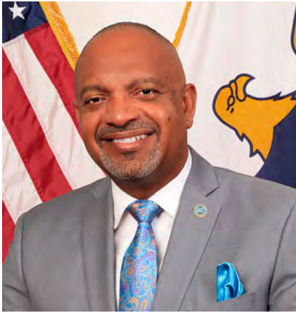
Lt. Governor Tregenza Roach

The Office of the Lieutenant Governor exercises powers and duties assigned by the Governor of the Virgin Islands (See Section 11 in the Elective Governor's Act). In addition, VI Code Section 22, subsection 51(a) and 51(b), provides that the Lieutenant Governor is also the Commissioner of Banking and Insurance.