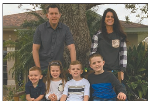
SUNTREE FAMILY , page 4