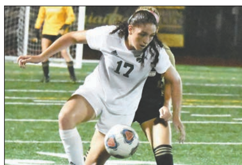
SOCCER PHENOM , page 12