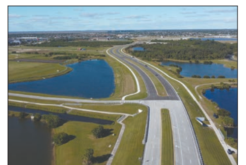
QUICKER ROUTE , page 24