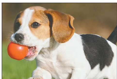
BEST FRIEND FUN , page 2