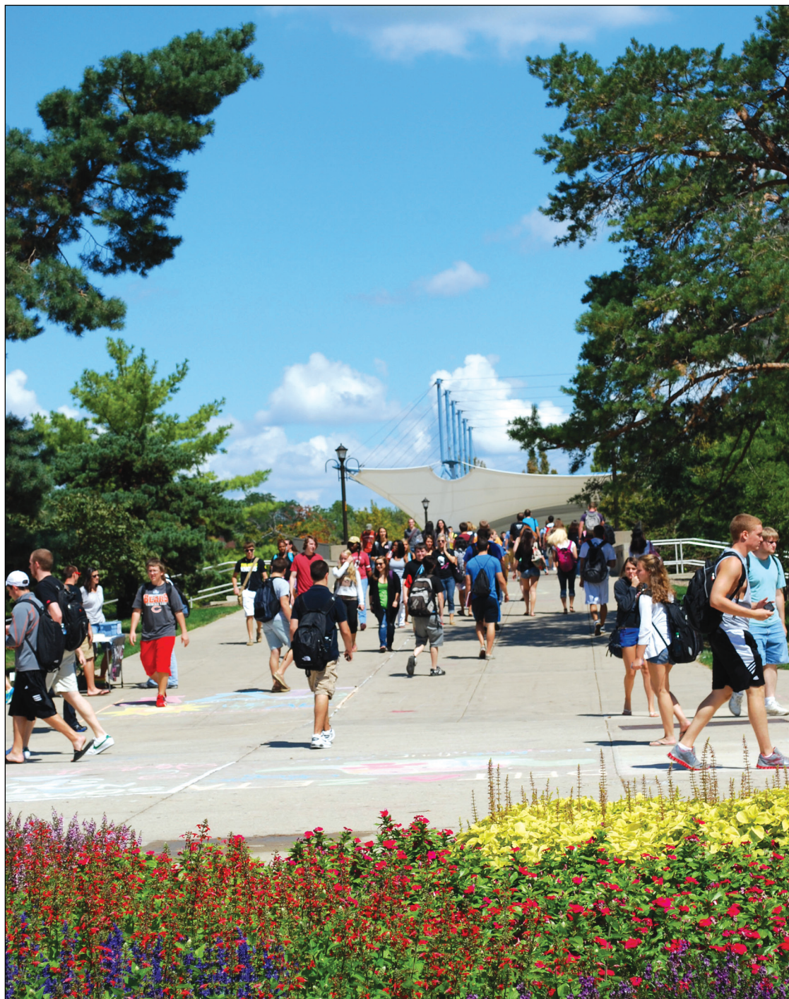
Students travel through the Quad to classes on Monday afternoon. The first day of classes after summer vacation was sunny with a high of 75 degrees.