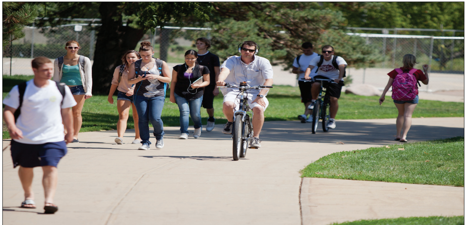
Bicyclists and pedestrians share a congested sidewalk on campus Monday afternoon. The proposed addition of bike lanes to the surrounding area's roads could help mitigate pedestrian traffic on and around campus.