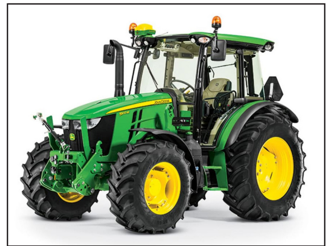
John Deere, 5100M tractor