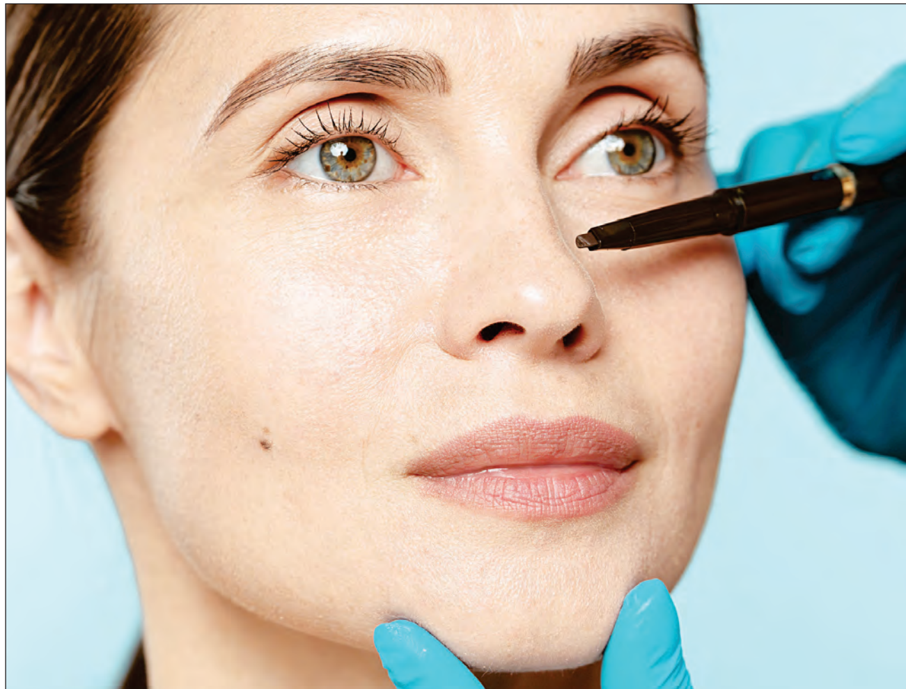
Doctors say people are increasingly opting for discreet plastic surgery that focuses on the tip of the nose, or minimizes it without changing the front view.

Members of the trade group performed about 48,423 rhinoplasties in 2024, compared with 32,484 in 2019. More than 5.3 million procedures done with hyaluronic filler to the face took place in 2024. Nose-filler procedures, also known as liquid rhinoplasties, aren't