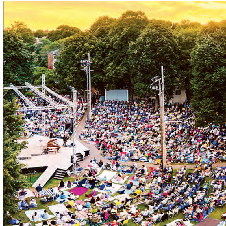
"Rodgers + Hammerstein's Cinderella" is this year's summer musical at Prescott Park.

Too hot for beachcombing on Ocean Boulevard? The Hampton Beach Casino Ballroom hosts a cool slate of concerts all summer long, while Aces & Eights Casino gives you the opportunity to spin the roulette wheel, play a hand of poker or try your luck at one of the gaming machines. For more information: casinoballroom.com and acesandeights casinos.com .