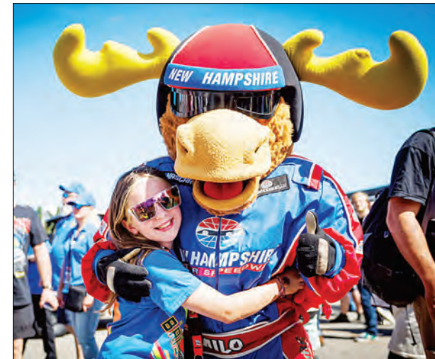
Milo the Moose meets with a young race fan at the New Hampshire Motor Speedway in Loudon.