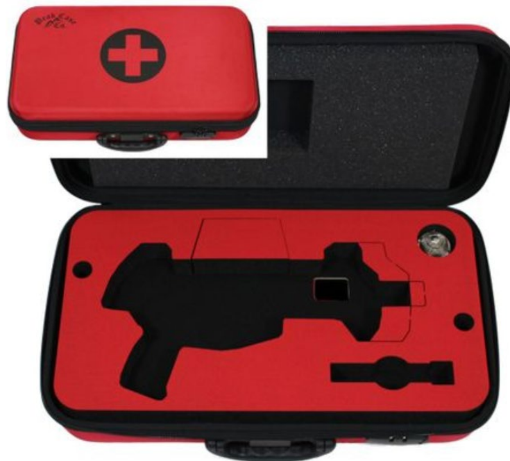
Stock Photograph of CZ Scorpion EVO Case