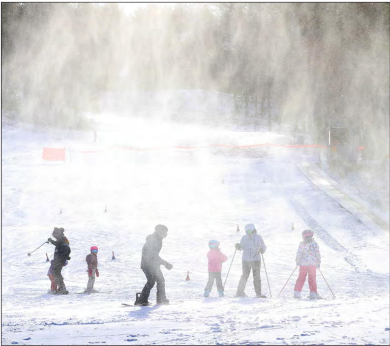
Skiers make their way through the spray from snowmaking at McIntyre Ski Area in Manchester. McIntyre should be seeing plenty of action during the holiday vacation weeks.

The Millyard Museum (manchester-historic.org), located two floors down from SEE at 200 Bedford St., tracks the history of the Queen City, with a particular emphasis on the great textile mills that put the city on the industrial map of the 19th century.