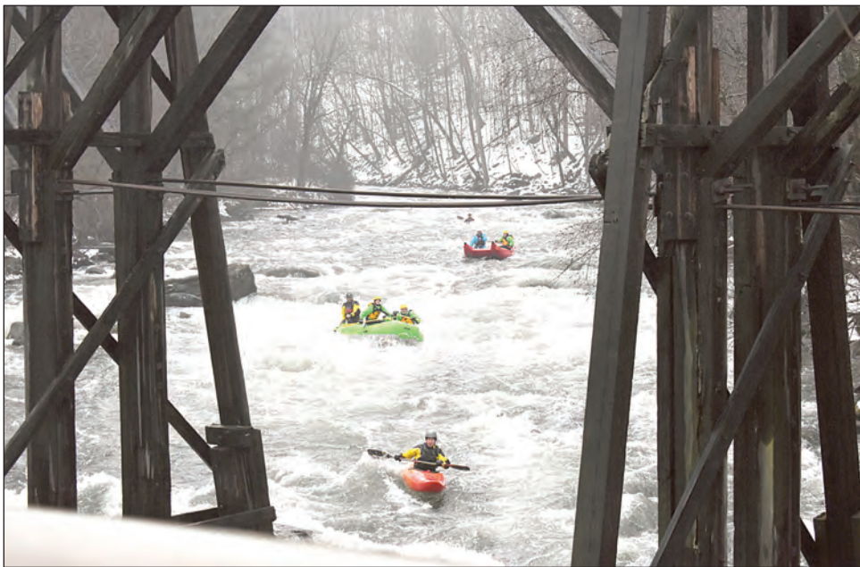
First Day Kayaks on the Winnepesaukee River has become a New Year's Day tradition in Franklin.