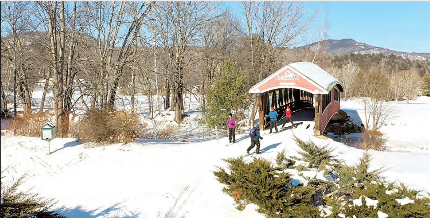
Cross-country skiers enjoy the trails of the Jackson Ski Touring Foundation ( jacksonxc.org ) in the Mount Washington Valley.