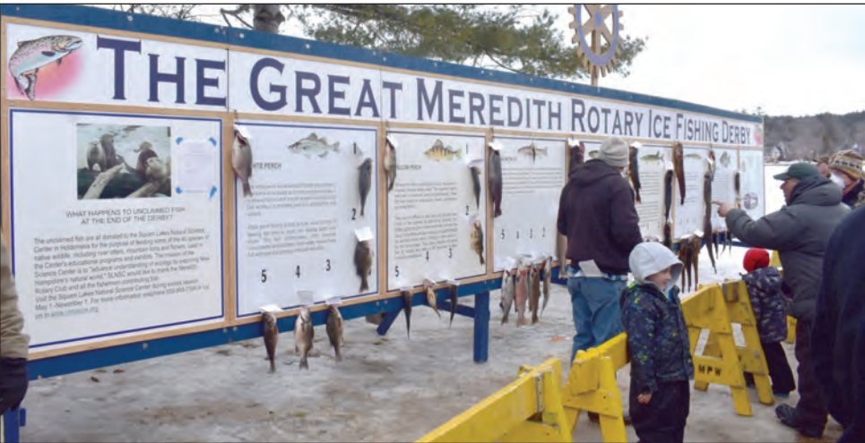
Headquarters of the Great Meredith Rotary Ice Fishing Derby is in downtown Meredith, but fishermen can catch their potential prizewinners in any New Hampshire lake or pond.