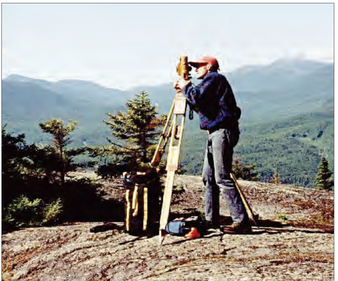
PROVIDED BY HEB ENGINEERS

In 1993, HEB was engaged by the National Park Service to survey New Hampshire and Vermont boundaries of the Appalachian National Scenic Trail corridor.