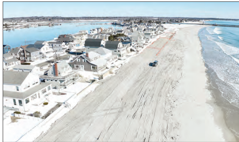
A project in Wells, Maine, included hydraulic dredging in Wells Harbor, with dredged material transported by pipeline to Wells Beach for dune restoration.

During this phase, our work included confirming grades and checking the crest elevation of the proposed dune as the beach