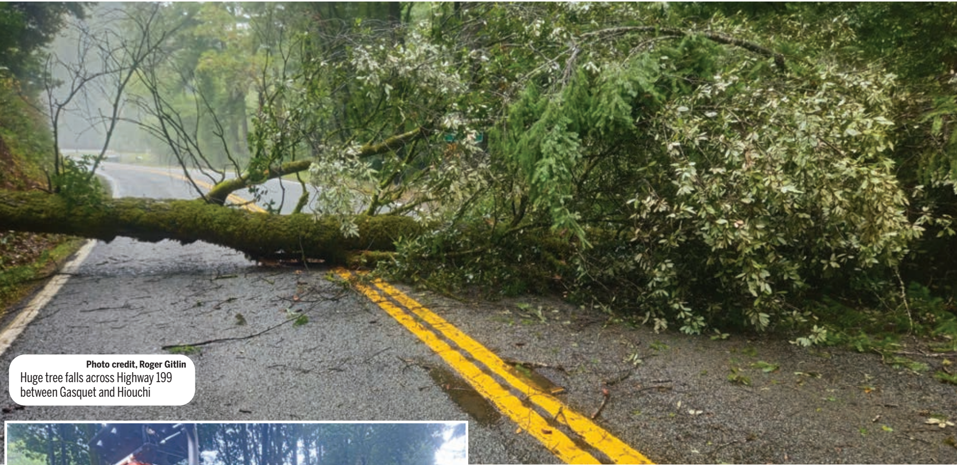
Huge tree falls across Highway 199 between Gasquet and Hiouchi