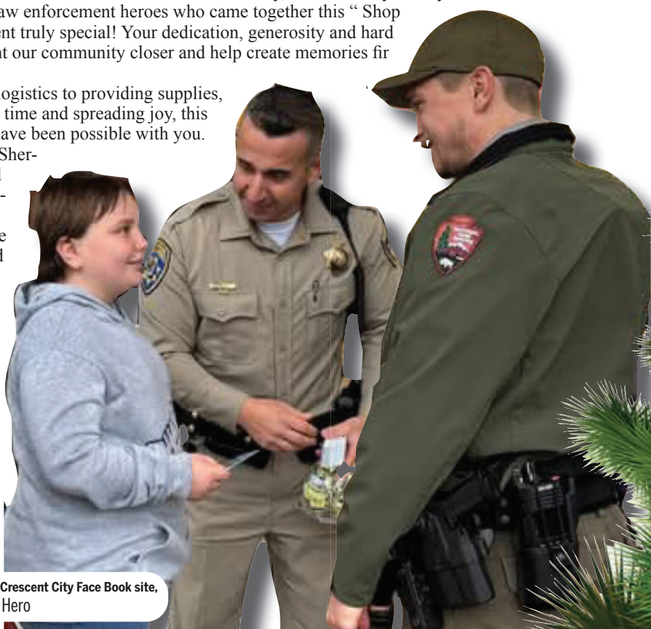
Shopping without a Hero

Merry Christmas, Happy Hanukkah and Happy New Year from law enforcement Del Norte