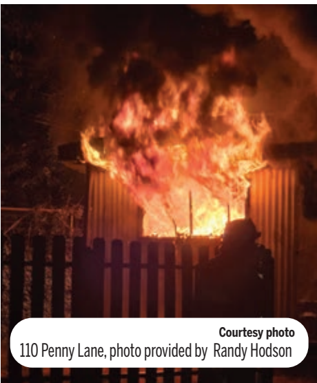
110 Penny Lane