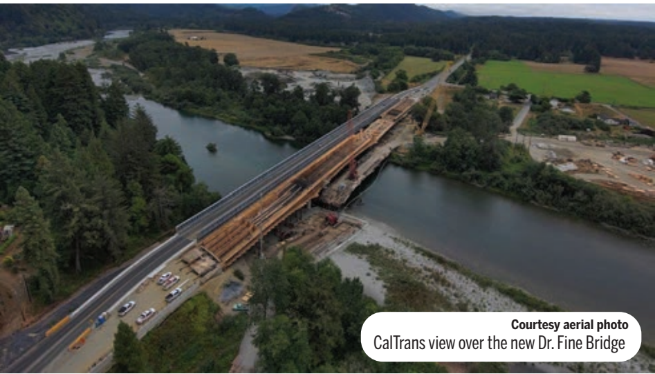
view over the new Dr. Fine Bridge