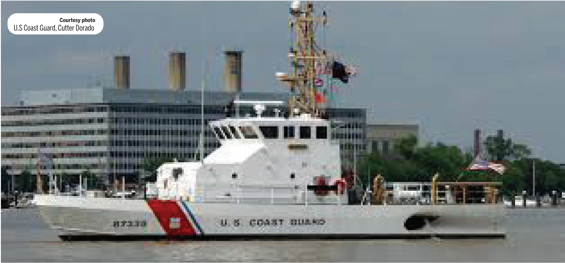
Cutter Dorado