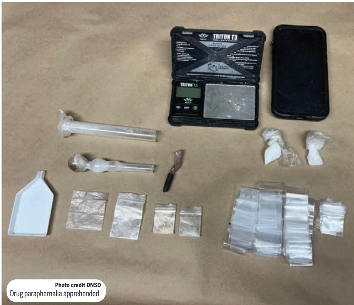
Drug paraphernalia apprehended