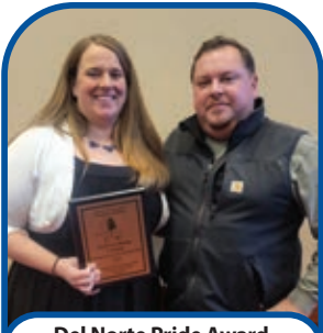
Del Norte Pride Award SeaFront Baking Co