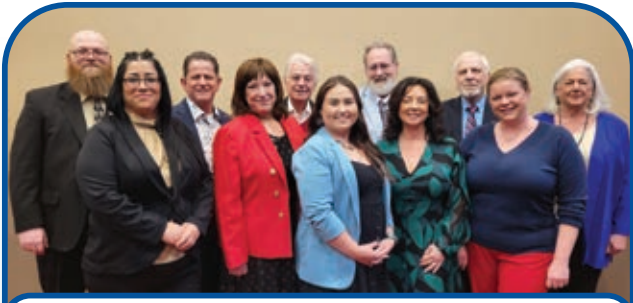
2025 Chamber Board of Directors