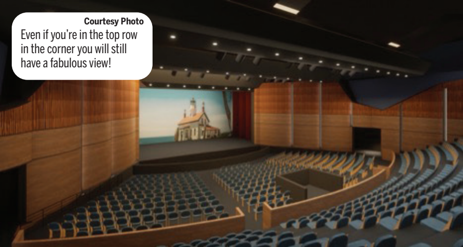
Even if you're in the top row in the corner you will still have a fabulous view!