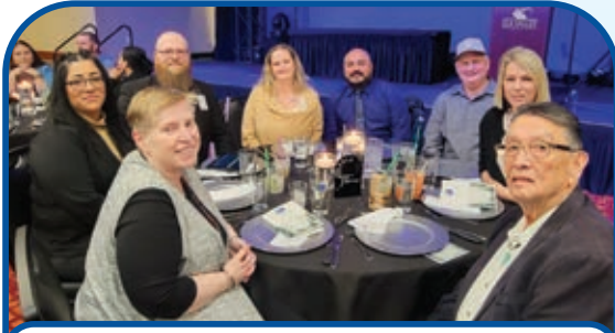
New Business of the Year Elk Valley Tribal Fuel Mart