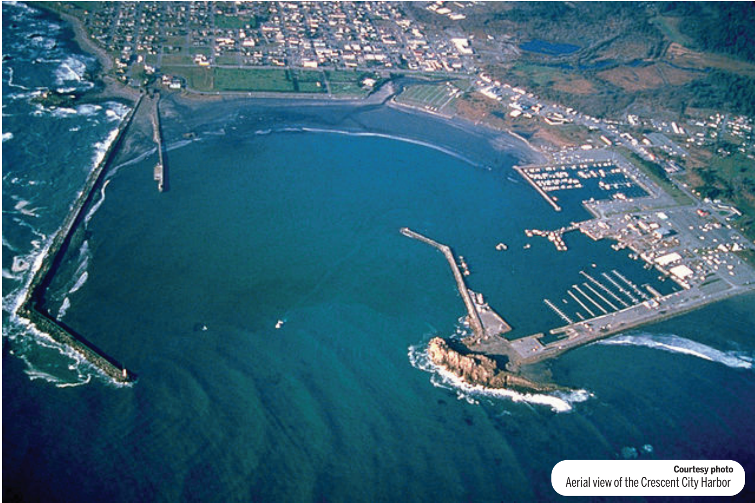
Aerial view of the Crescent City Harbor