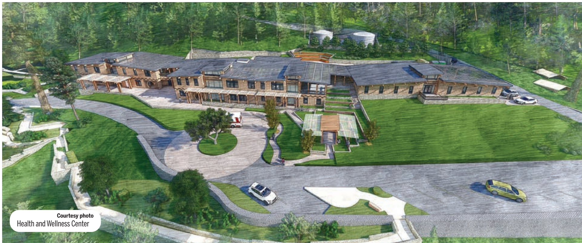
Health and Wellness Center