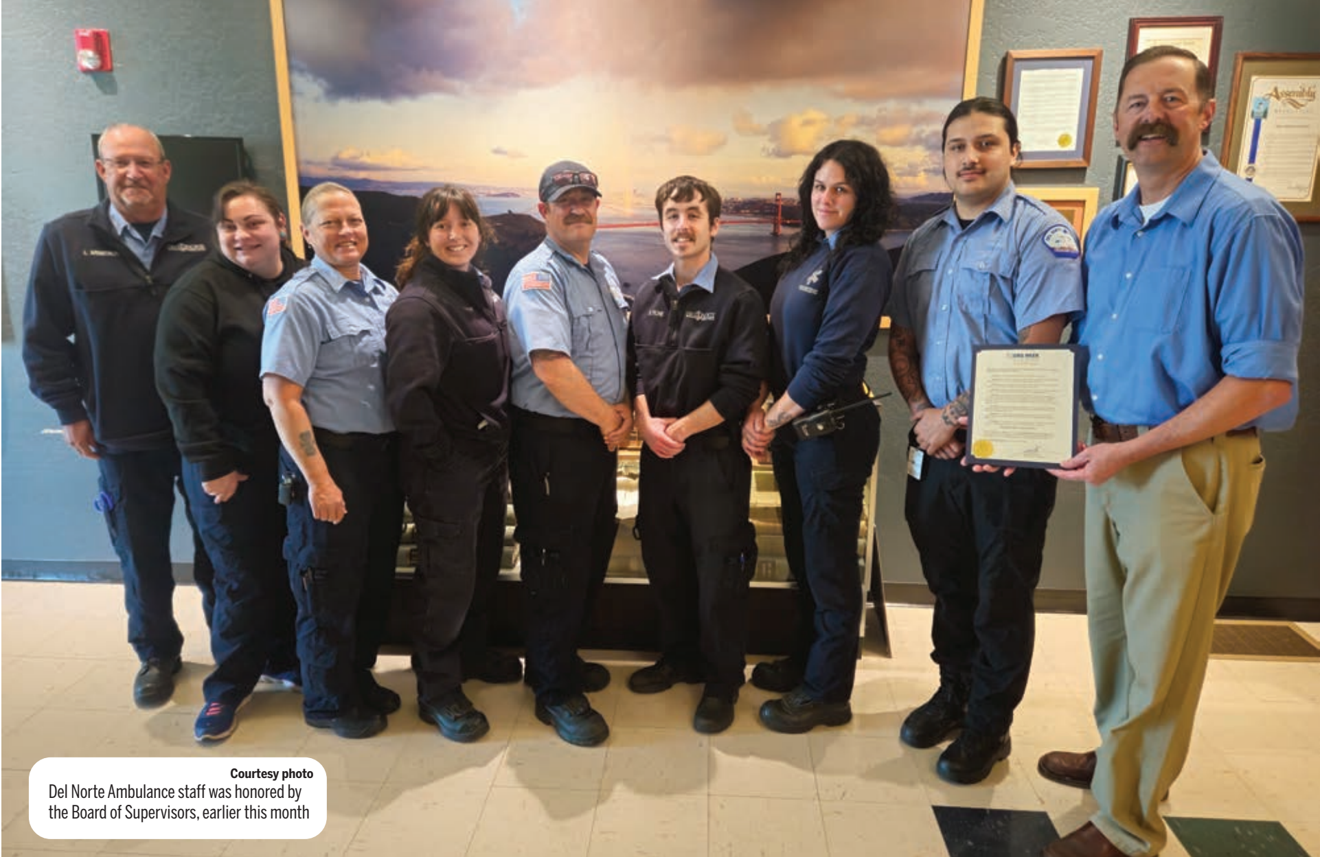
Del Norte Ambulance staff was honored by the Board of Supervisors, earlier this month