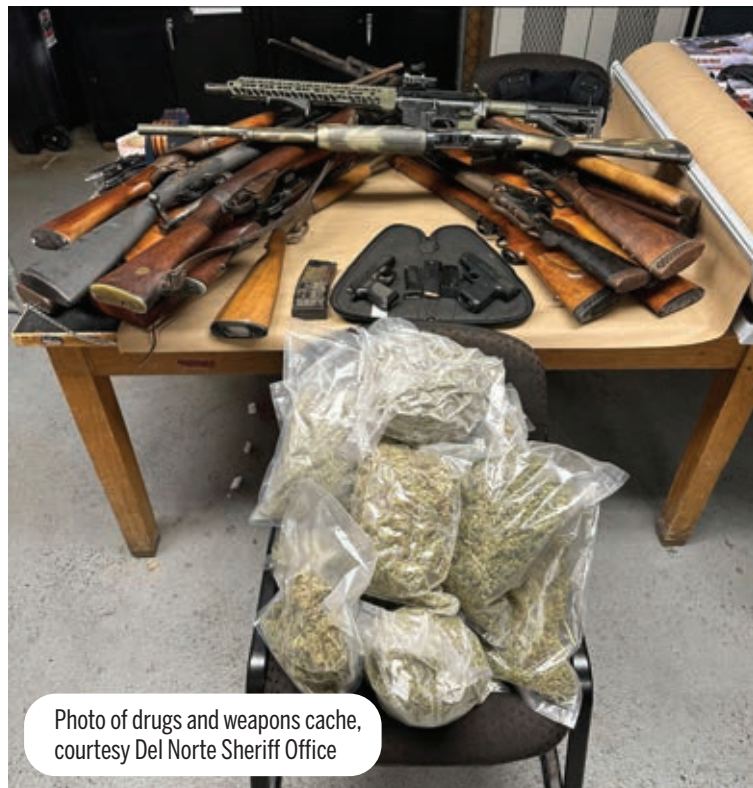
Photo of drugs and weapons cache