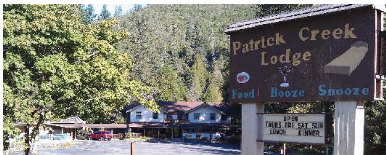
ABOVE

Weddings, Birthdays and all special events are immediately welcomed.