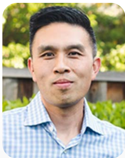
Lanhee Chen State Controller