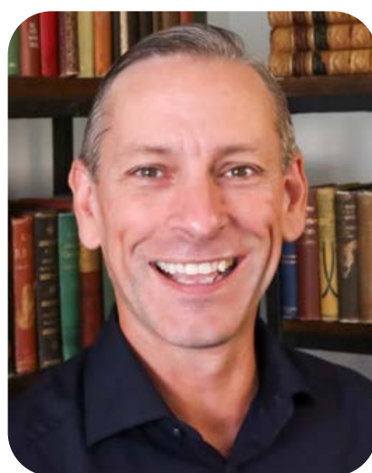
Mark Meuser U.S. Senate