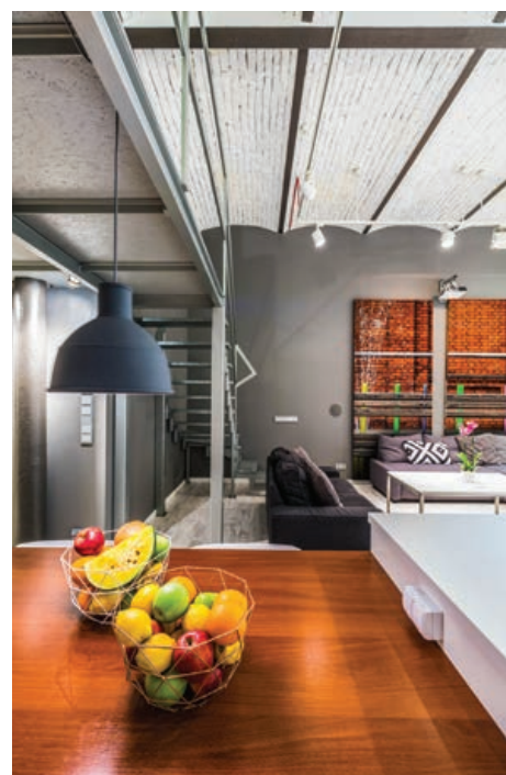
Photo spreads in home design magazines can be awe-inspiring. Quite often homeowners wish they could lift the looks right off the pages of magazines and transform their own homes into picture-perfect retreats.

It takes an eye for design to pull a room together — even with inspiration — and make it both functional and attractive. While hiring an interior designer is one way to go, homeowners can use some of the tricks and techniques the designers employ to do a remarkably good job of improving the interiors of their homes without such help.