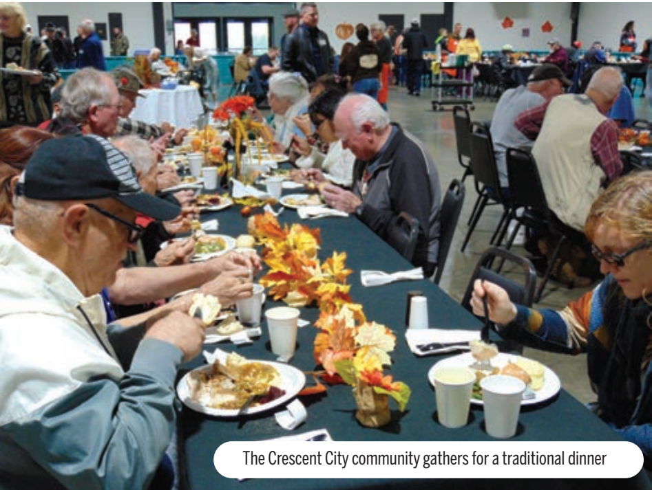
The Crescent City community gathers for a traditional dinner