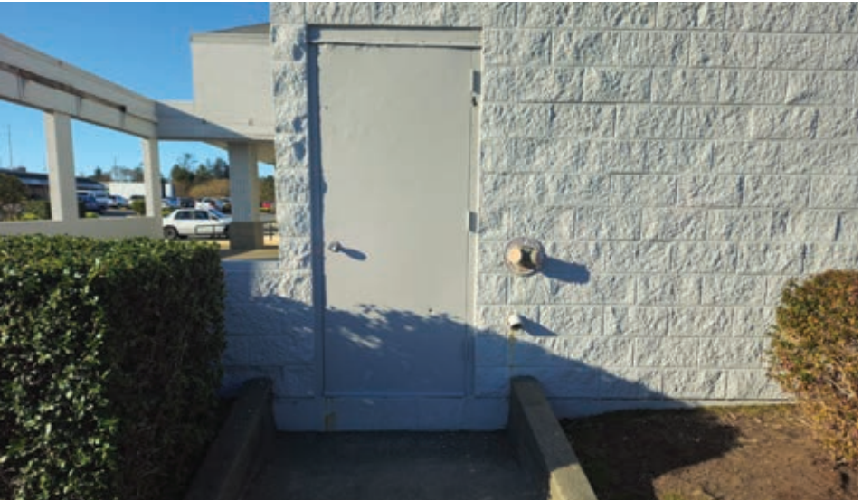
South door of Rite-Aid building, 5th and 101 North