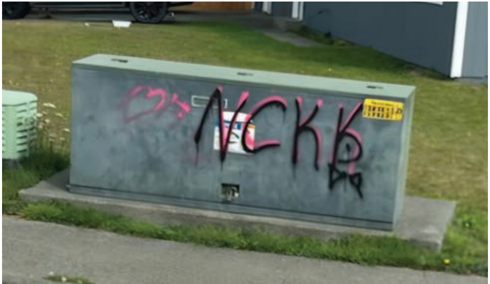
YET TO BE ABATED - Pacific Power boxes, Crescent City