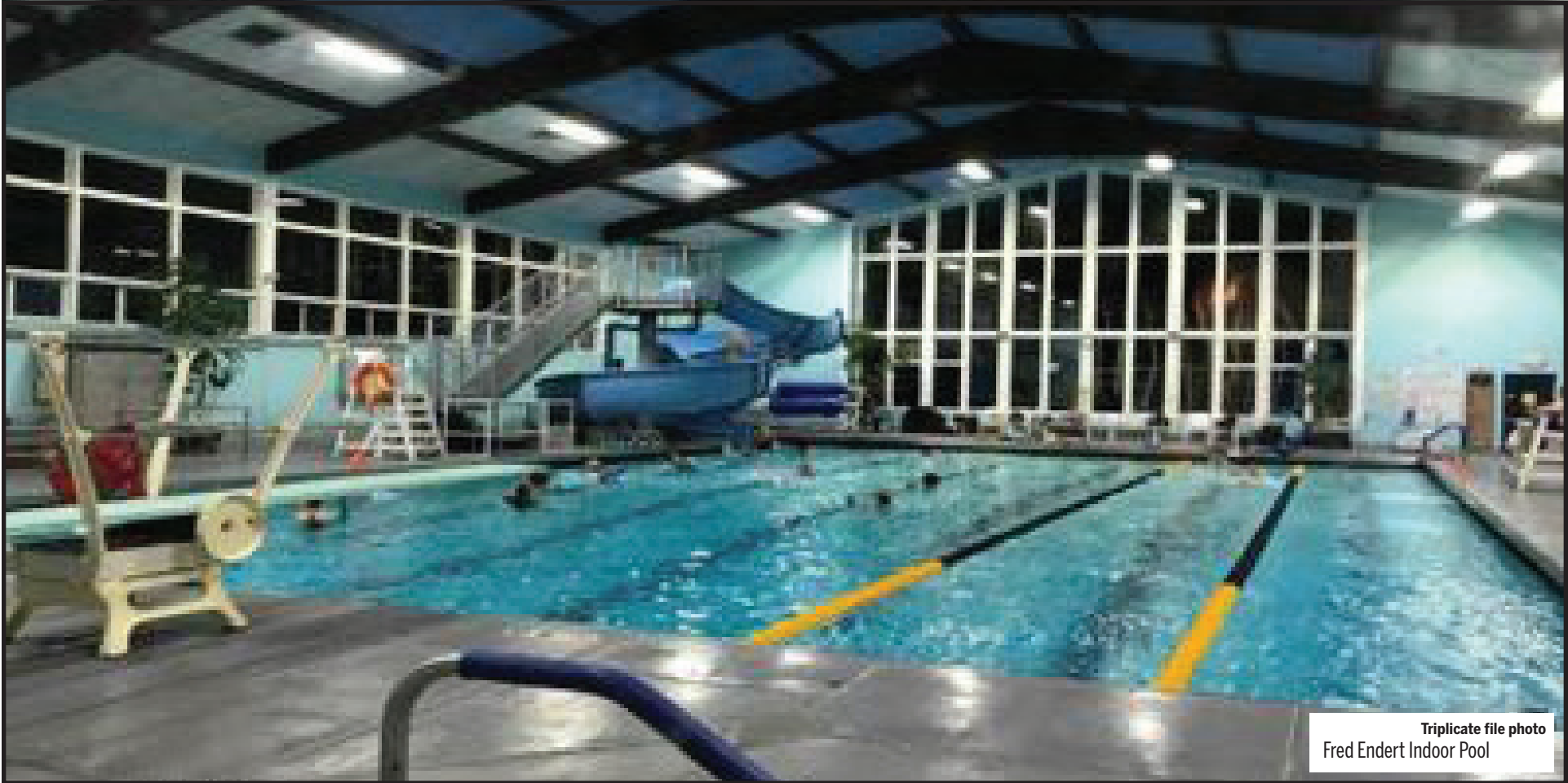
Triplicate file photo Fred Endert Indoor Pool