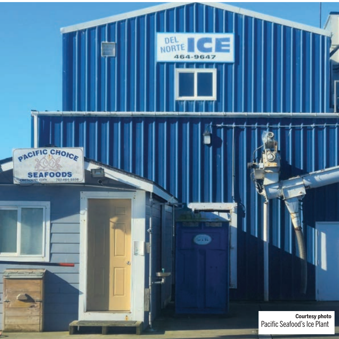
Pacific Seafood's Ice Plant