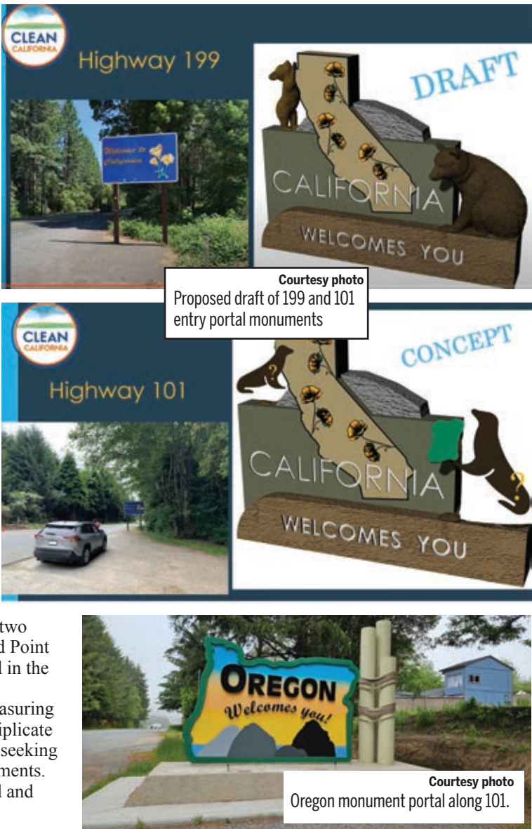
Proposed draft of 199 and 101 entry portal monuments