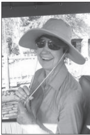
a legacy of love, faith, and gratitude, offering a final message: “May peace be with you, and know that I love you!”