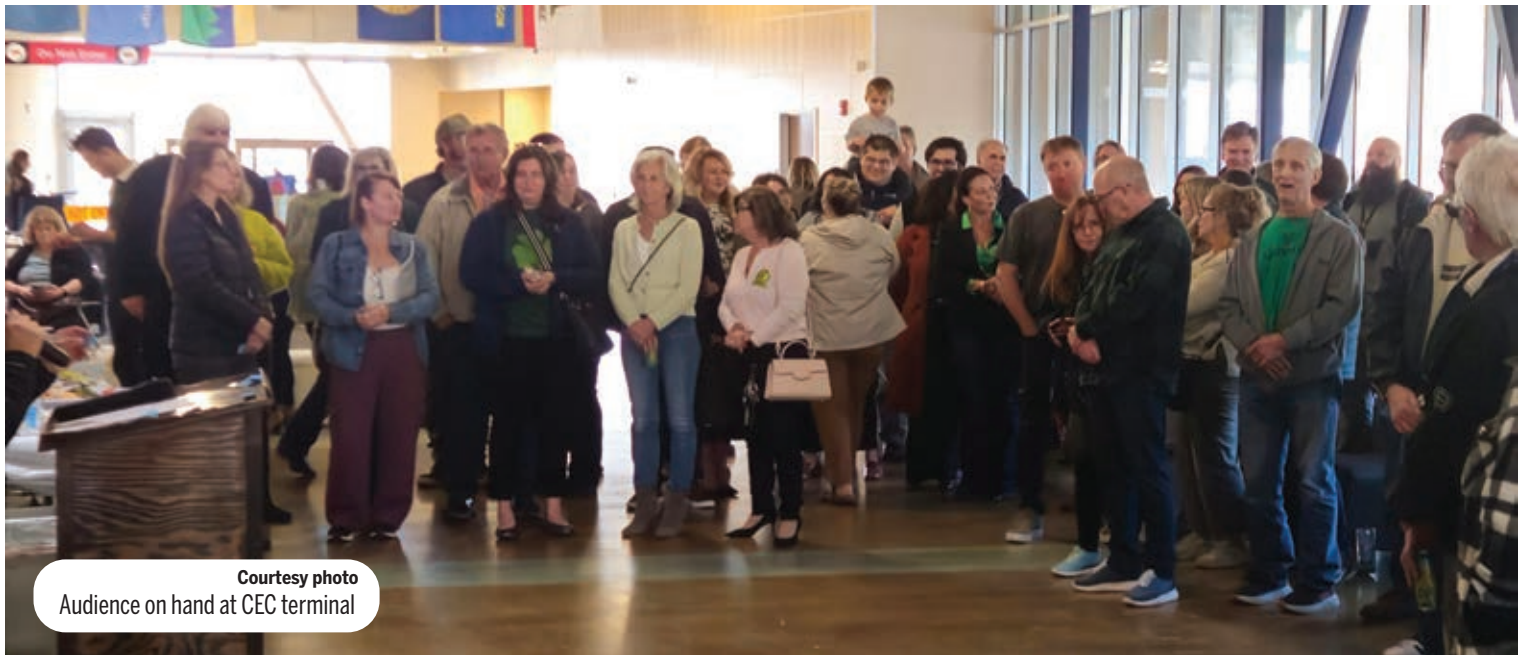
Audience on hand at CEC terminal