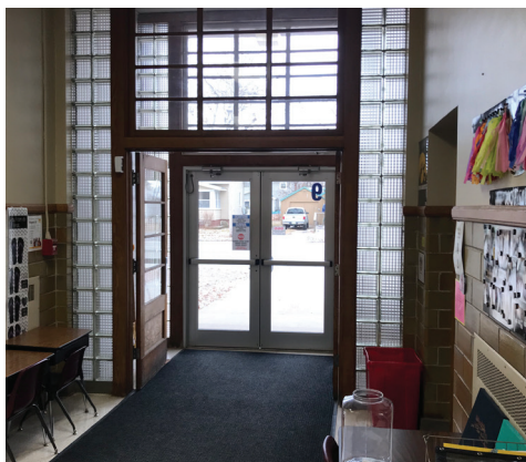
School Entrances Open To Public