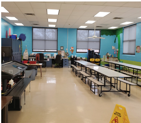
Limited Lunch Seating