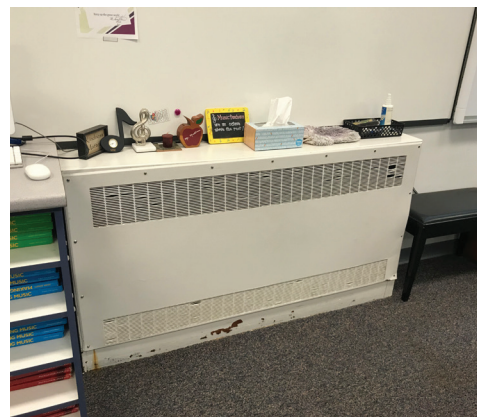
Heating Systems Aged Beyond Expected Use

WEBSITE TO LEARN MORE: https://sites.google.com/ifacadets.net/buildingproject