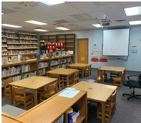
Library Lacks Storage