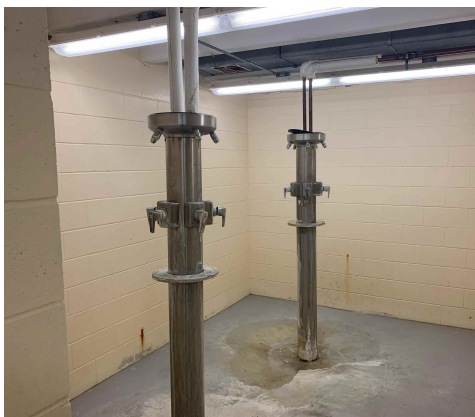
Restroom / Locker Facilities Aged