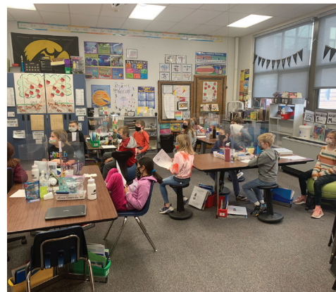
No Breakout Areas In Classroom