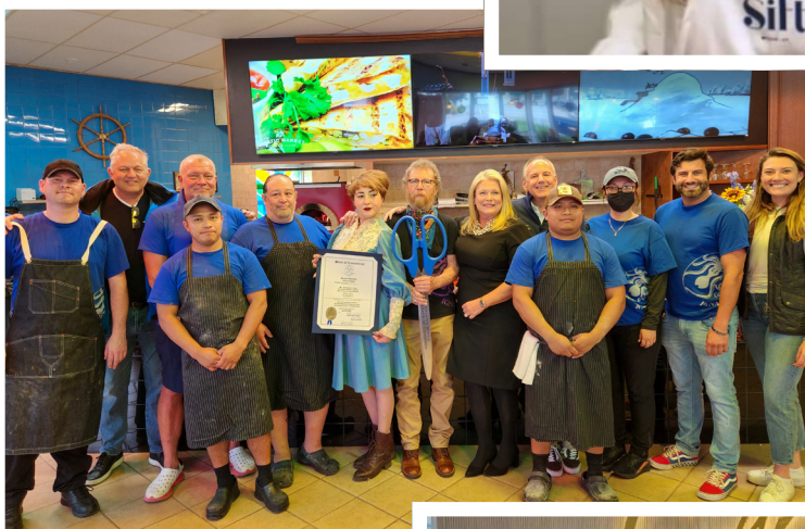
Ribbon Cutting at Ignazio's the Pizza.