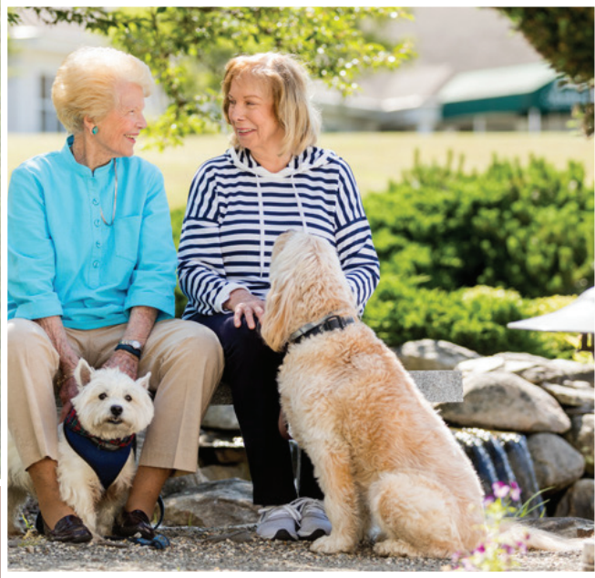
Chart your own course with our flexible retirement options