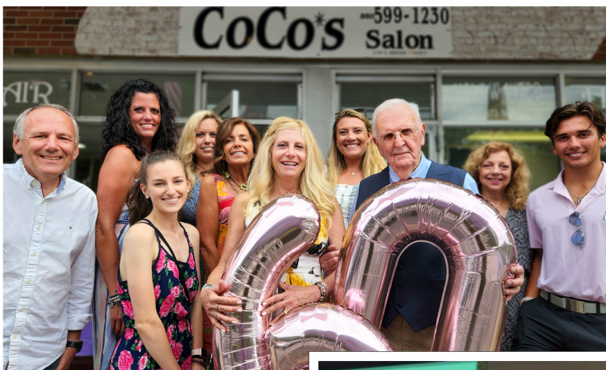
Celebration of the 60th Anniversary of Coco's Salon in Pawcatuck