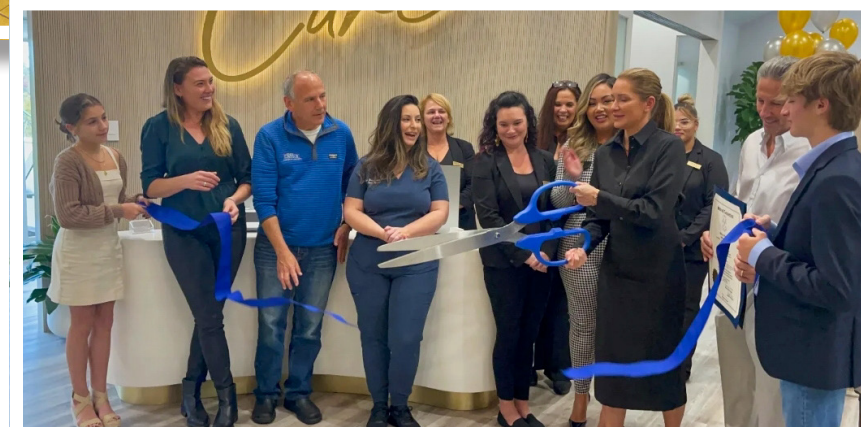
Ribbon Cutting at Cure Med Spa.