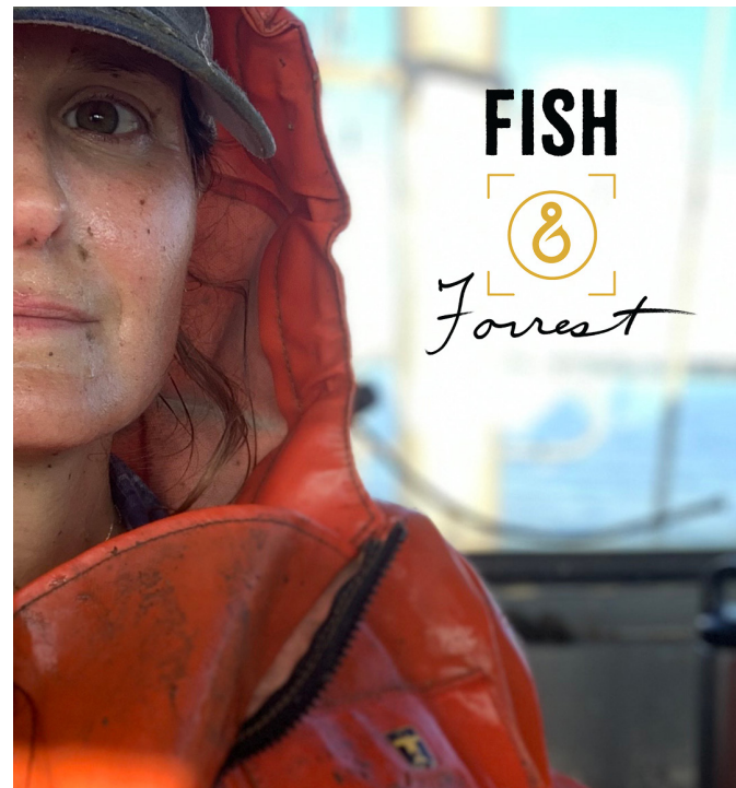
LEFT: Chamber members were offered two free tickets to the Fish & Forest exhibit at the Mystic Seaport Museum.