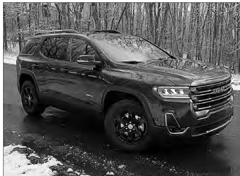
The 2020 Acura MDX (top), priced from $45,525, brings a powerful V6 engine and provides sporty handling. Meanwhile, the 2020 GMC Acadia (bottom) looks more like a traditional SUV than most seven-passenger crossovers.

manage a skimpy 1,500 pounds, versus a more respectable 4,000 pounds for the V6.