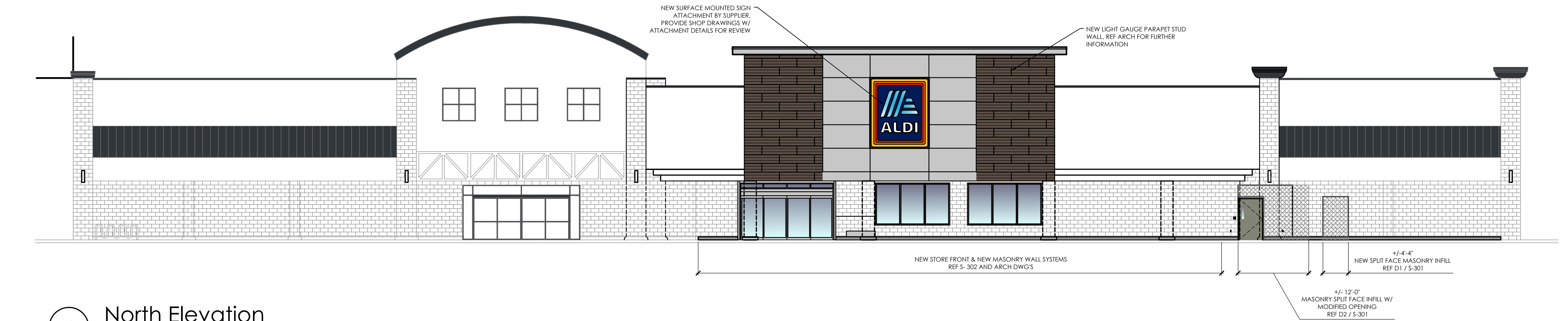
4 North Elevation SCALE: 3/32" = 1'-0"

IMPORTANT NOTE REGARDING EXISTING STRUCTURAL MEMBERS: AT THE TIME THESE DRAWINGS WERE PREPARED, STRUCTURAL SHELL AS-BUILT DRAWINGS AND VISUAL OBSERVATION OF PERTINENT STRUCTURAL ELEMENTS WERE LIMITED. THEREFORE, PRIOR TO FABRICATION AND CONSTRUCTION, THE GENERAL CONTRACTOR SHALL FIELD VERIFY SIZES, LOCATIONS, DIMENSIONS, ELEVATIONS, AND CONDITION OF ALL PERTINENT EXISTING STRUCTURAL MEMBERS (CONCEALED OR EXPOSED). THE GENERAL CONTRACTOR SHALL NOTIFY THE ARCHITECT AND STRUCTURAL ENGINEER OF RECORD OF ANY DISCREPANCIES A MINIMUM OF 48 HOURS IN ADVANCE PRIOR TO CONSTRUCTION TO ALLOW FOR MODIFICATION OF DESIGN PER UNFORESEEN FIELD CONDITIONS.