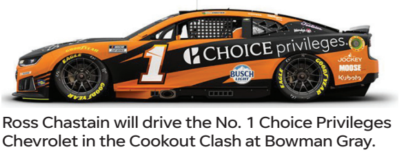
Ross Chastain will drive the No. 1 Choice Privileges Chevrolet in the Cookout Clash at Bowman Gray.