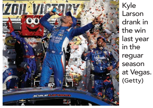
Kyle Larson drank in the win last year in the regular season at Vegas.