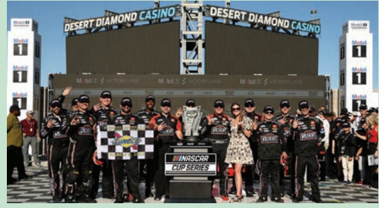
Christopher Bell and crew in Victory Lane Sunday at Phoenix.

- Christopher Bell, who grabbed his third straight Cup win in Sunday's Shriners Children's 500, which he also won last season