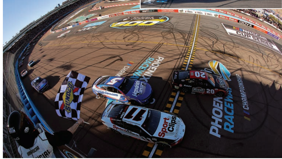
Christopher Bell, driver of the #20 Reser's Fine Foods Toyota, takes the checkered flag to win the Cup Series Shriners Children's 500 at Phoenix Raceway on Sunday.

Christopher Bell prevailed in a dramatic side-by-side finish teammate Denny Hamlin to earn Bell his third consecutive Cup Series victory this season, a record in the sport's Next Gen Car era.