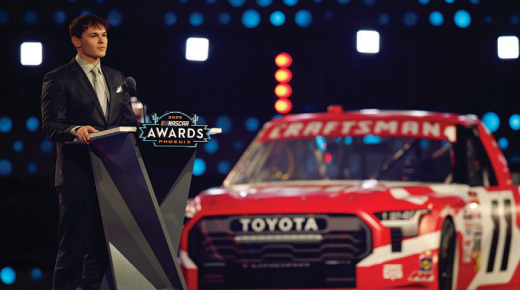
2025 NASCAR Craftsman Truck Series Champion Corey Heim speaks onstage during the 2025 NASCAR Awards Show at JW Marriott Desert Ridge Resort & Spa in Phoenix on Tuesday.