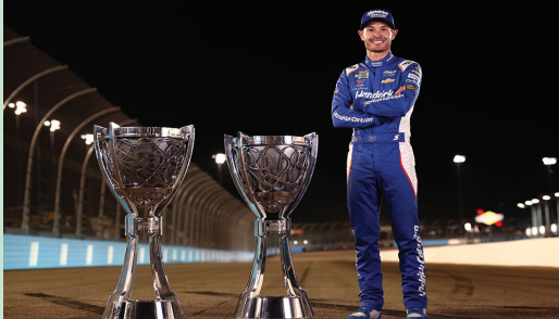
Kyle Larson poses with the Bill France 2025 and 2021 Cup Series Championship trophies after winning the Championship at Phoenix Raceway