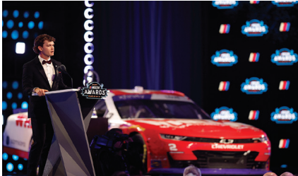
2025 NASCAR Xfinity Series Champion Jesse Love speaks onstage during the 2025 NASCAR Awards Show at JW Marriott Desert Ridge Resort & Spa on in Phoenix on Tuesday.