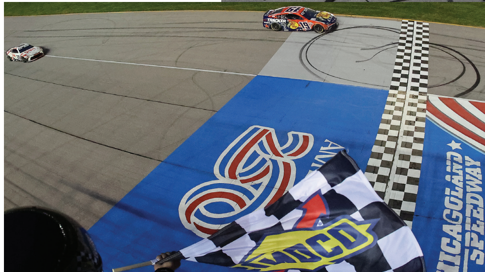
Chase Briscoe, driver of the #19 Bass Pro Shops Toyota, takes the checkered flag to win the Cup Series eero 400 at Chicagoland Speedway on Sunday.

In the closing laps of the 19th Cup Series race of the season, Chase Briscoe stayed off the charge of his determined Joe Gibbs Racing teammate, Christopher Bell, to win for the first time this season, the first time at Chicagoland and the sixth time in his career.