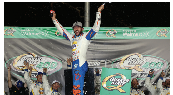
Chase Elliott, driver of the #9 NAPA/Children's Chevrolet, celebrated in Victory Lane last year after winning at EchoPark Speedway.