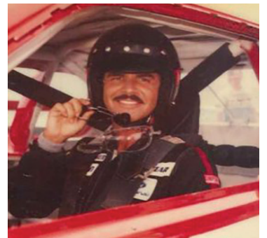
Burt Reynolds in 'Stroker Ace'

The 2017 film "Logan Lucky" used the facility as a stand-in for Charlotte Motor Speedway.