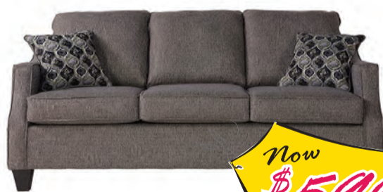
SMALL 73" APARTMENT SOFA