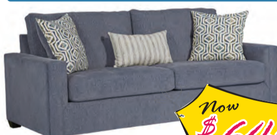
BLUE TRANSITIONAL SOFA