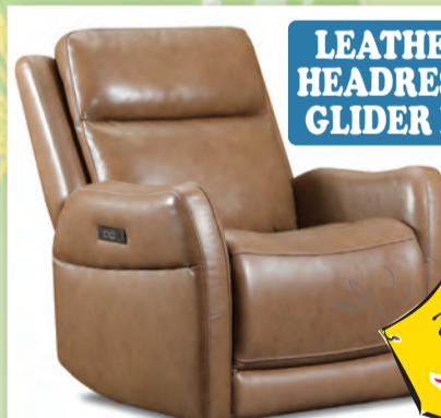
LEATHER POWER HEADREST SWIVEL GLIDER RECLINER