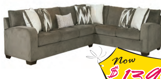
2 PIECE SECTIONAL