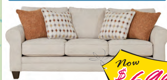
WOWZA SAND SOFA