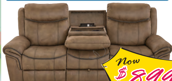
RECLINING SOFA WITH DROP DOWN TABLE