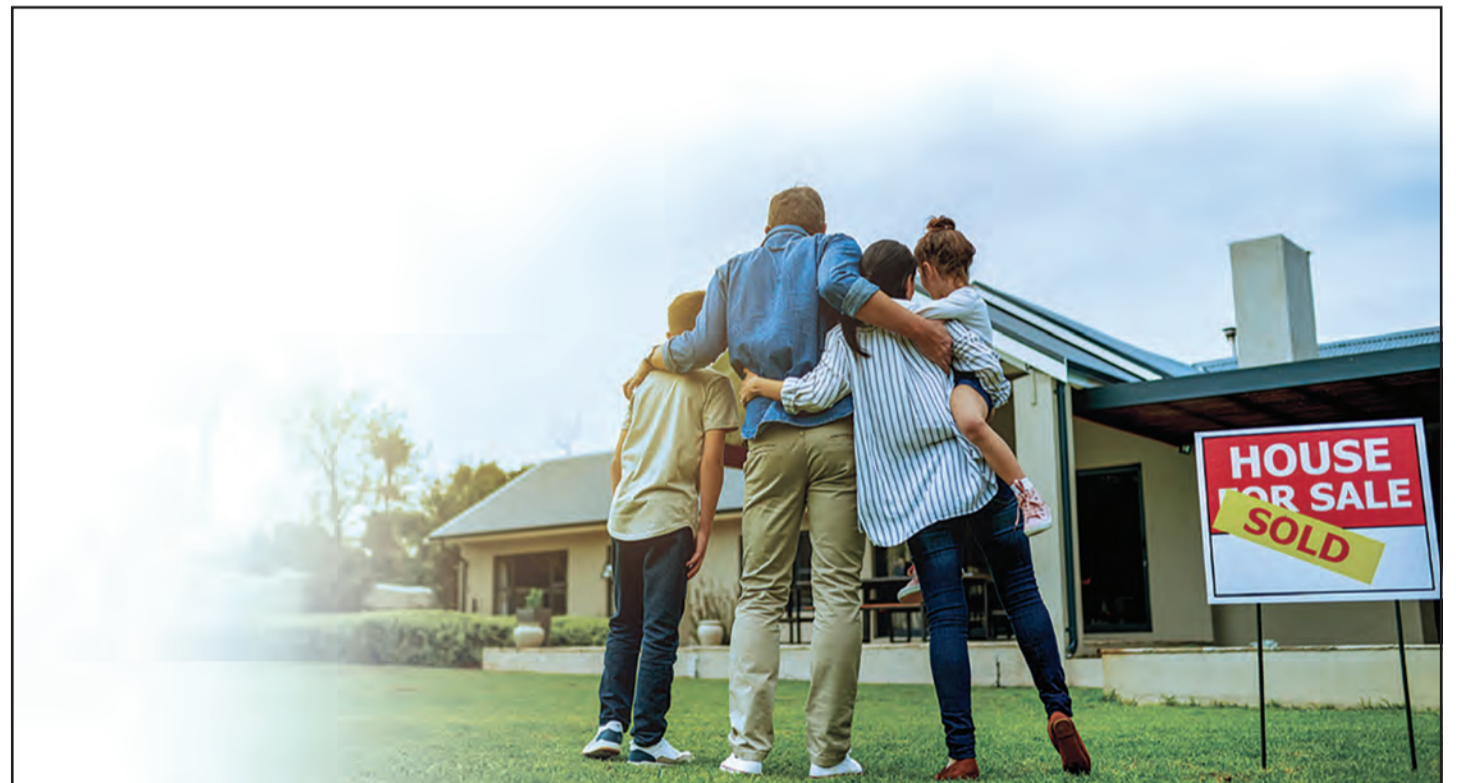
a home for the first time. Know your buying power.

Before it's time to sign a contract and get the keys, potential buyers can follow this guide as they navigate buying