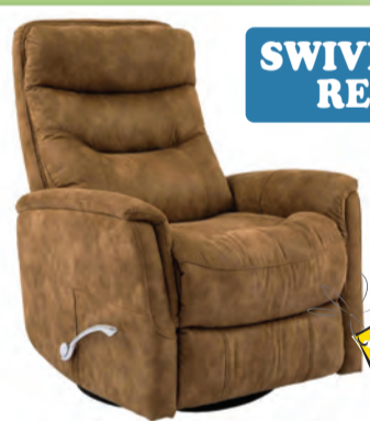
SWIVEL GLIDER RECLINER