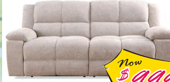
PLUSH RECLINING SOFA