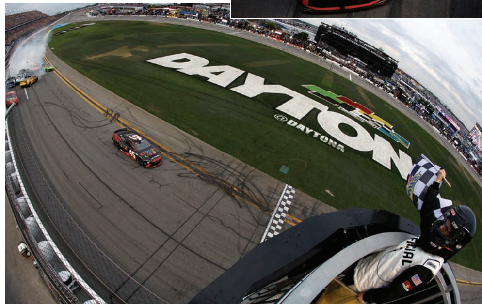
Tyler Reddick, driver of the #45 Chumba Casino Toyota, takes the checkered flag to win the Cup Series Daytona 500 at Daytona International Speedway on Sunday.