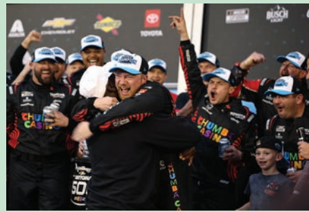
Tyler Reddick and Michael Jordan, NBA Hall of Famer and co-owner of 23XI Racing, celebrate with the crew in Victory Lane at Daytona Sunday.

"Last year was really hard for all of us, hard for me. When you're a Cup driver and you get to this level and drive for Michael Jordan, it's expected you win every single year. For us to go on that drought it made us look hard in the mirror, and I am really proud of everyone on our Chumba Casino Toyota Camry. — Tyler Reddick, who used a last lap pass to take the Daytona 500 Sunday