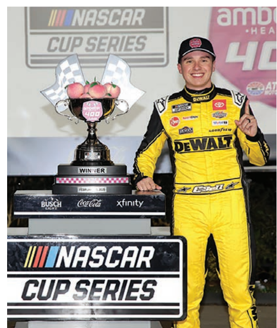
Christopher Bell, driver of the #20 DEWALT Toyota, celebrated in Victory Lane after winning last season at Atlanta.