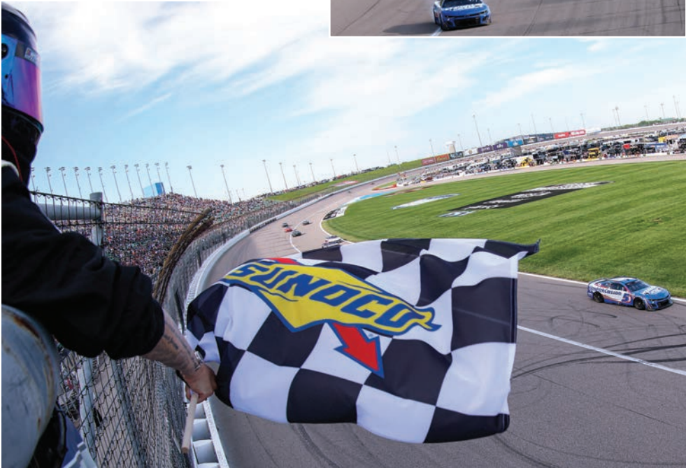
Kyle Larson, driver of the #5 HendrickCars.com Chevrolet, takes the checkered flag to win the Cup Series AdventHealth 400 at Kansas Speedway on Sunday.

Sunday's triumph was Kyle Larson's third of the season, tying Christopher Bell for most in the series this year. The win was Larson's third at Kansas and the 32nd of his career.