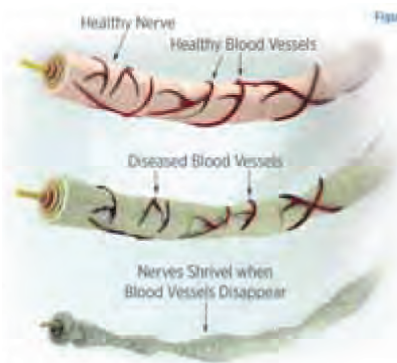
Figure 2: When these very small blood vessel become diseased they begin to shrivel up and the nerves begin to degenerate.

As you can see in Figure 2, as the blood vessels that surround the nerves become diseased they shrivel up, which caused the nerves to not get the nutrients to continue to survive. When these nerves begin to “die”, they cause balance problems,