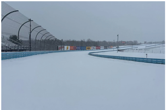
Watkins Glen International