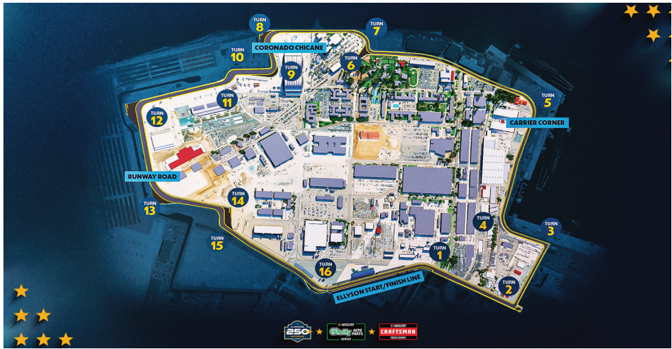
San Diego Naval Base Coronado street course map