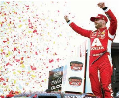
William Byron won in OT last year at Martinsville.

2010: Denny Hamlin stormed four-abreast through traffic on a late restart to steal the win.