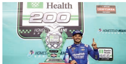
WINNER: KYLE LARSON

• Friday's BAPTIST HEALTH 200, Homestead-Miami Speedway