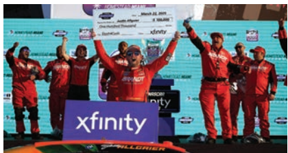
WINNER: JUSTIN ALLGAIER

• Saturday's HARD ROCK BET 300, Homestead-Miami Speedway