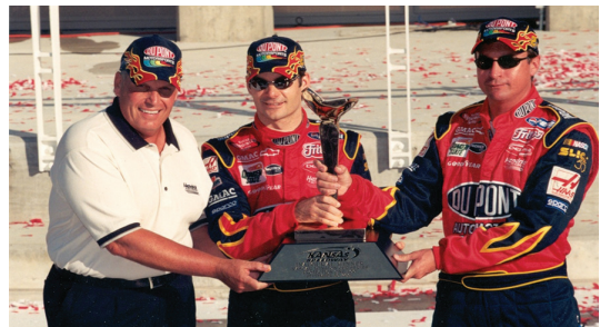
Jeff Gordon with the trophy after winning inaugural Kansas race.