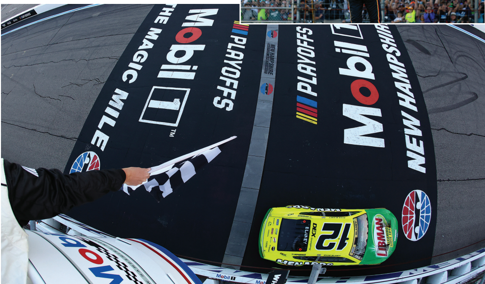
Ryan Blaney, driver of the #12 Menards/Libman Ford, takes the checkered flag to win the Cup Series Mobil 1 301 at New Hampshire Motor Speedway on Saturday.

Ryan Blaney's victory Sunday at New Hampshire Moto Speedway cashes the popular 2023 series champion's ticket into the Round of 8 in pursuit of his second Cup title.