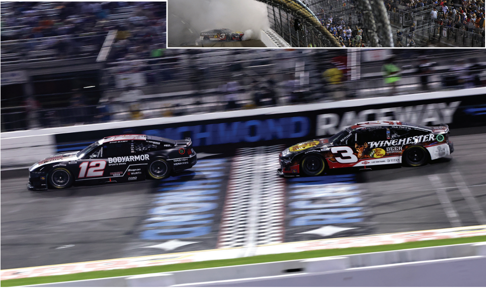
Eventual winner Austin Dillon, driver of the #3 Bass Pro/Winchester Chevrolet, and Ryan Blaney, driver of the #12 BodyArmor Sports Drink Ford, battle during the Cup Series Cook Out 400 at Richmond Raceway on Saturday.

Austin Dillon led 107 laps on Saturday night at Richmond, including the final 49, to claim the victory and automatic berth in the 16-driver Cup Playoff field.