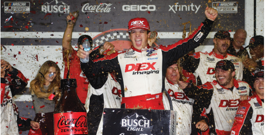
Harrison Burton snagged a Playoff berth with a win last year in the Coke Zero 400.