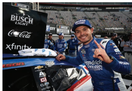
Kyle Larson won last year's Food City 500 at Bristol.