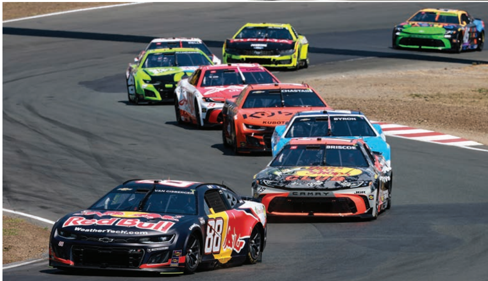
Eventual winner Shane van Gisbergen, driver of the #88 Red Bull Chevrolet, leads the field during the Cup Series Toyota/Save Mart 350 at Sonoma Raceway on Sunday.