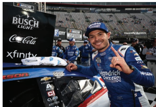
Kyle Larson won last year's Food City 500 at Bristol.