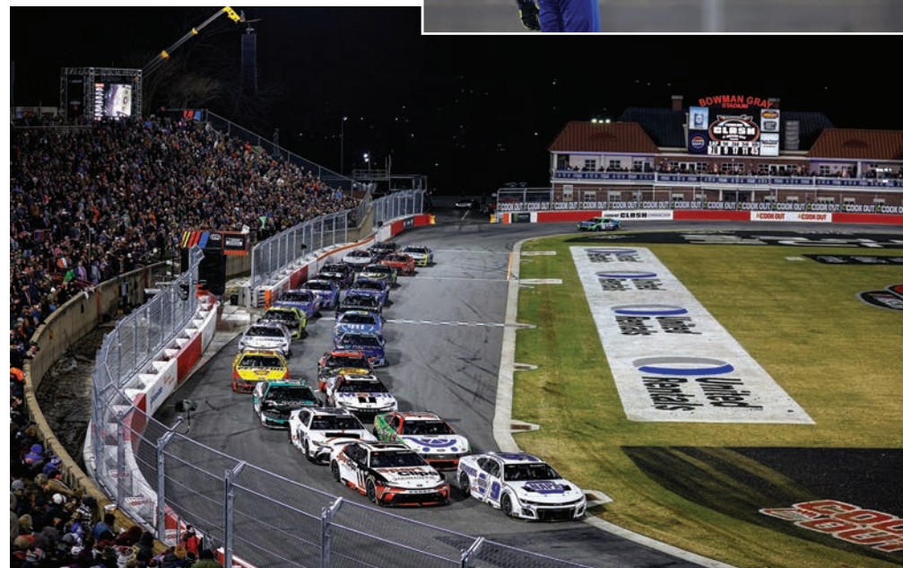
Eventual winner Chase Elliott, driver of the #9 NAPA Auto Parts Chevrolet, and Denny Hamlin, driver of the #11 Sport Clips Haircuts Toyota lead the field during the Cook Out Clash at Bowman Gray Stadium on Sunday.