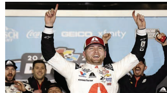
William Byron celebrated after winning last year's Daytona 500.