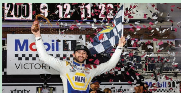
Chase Elliott in Victory Lane Sunday at Bowman Gray.

- Chase Elliott, who held off a dramatic charge from Ryan Blaney to win Sunday night's Cook Out Clash at Bowman Gray Stadium