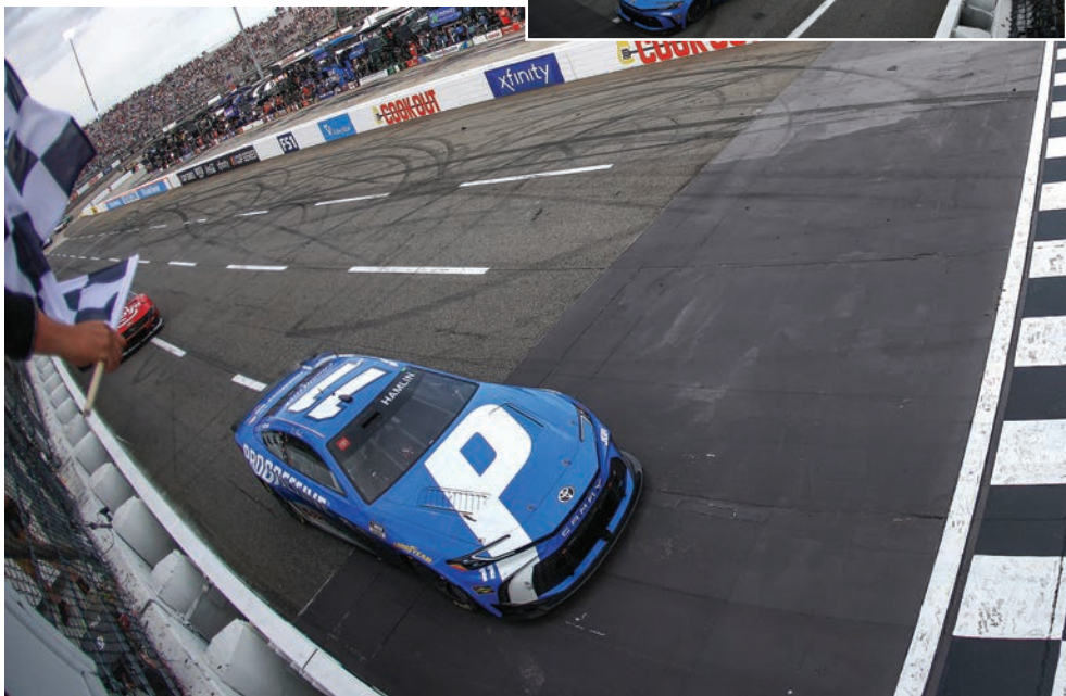
Denny Hamlin, driver of the #11 Progressive Toyota, takes the checkered flag to win the Cup Series Cook Out 400 at Martinsville Speedway on Sunday.

Denny Hamlin pulled away toward the end of the final 75-lap green-flag run and beat Christopher Bell, his Joe Gibbs Racing teammate, to the finish line by 4.617 seconds. Sunday at Martinsville.