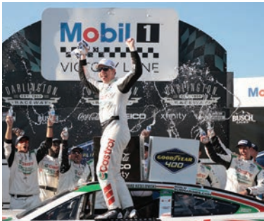
Brad Keselowski picked up a nice win last year at Darlington.