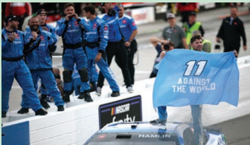
Denny Hamlin and crew celebrate Sunday at Martinsville.

- Denny Hamlin, who grabbed his first Cup win of the season in Sunday's Cook Out 400