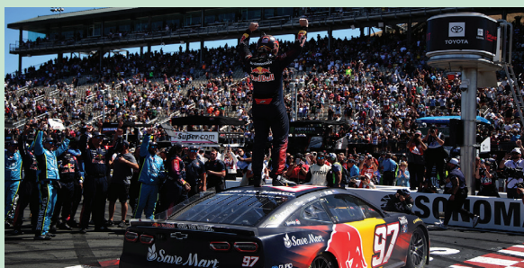
SvG in Victory Lane Sunday at Sonoma.

— Shane van Gisbergen, who grabbed his second win of the season Sunday at Sonoma Raceway