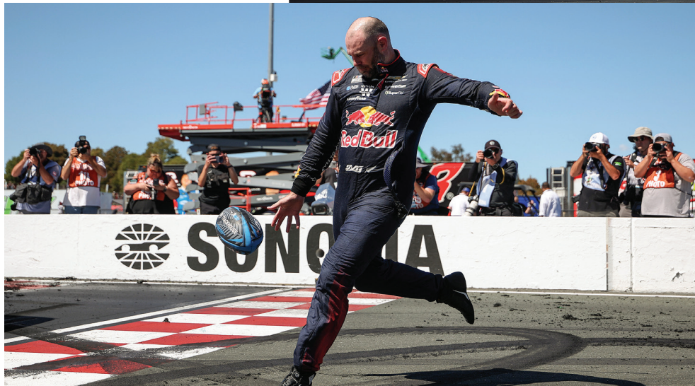
Shane van Gisbergen, driver of the #97 Red Bull Chevrolet (top), kicks a rugby ball into the crowd in celebration of winning the Cup Series Toyota/Save Mart 350 at Sonoma Raceway on Sunday.