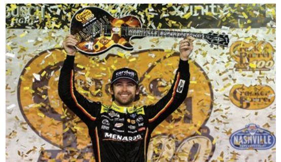
Ryan Blaney rocked out in Victory Lane after winning last year's Cracker Barrel 400.