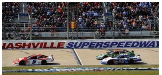
Cars racing at an O'Reilly Auto Parts Series event at Nashville in 2008.

• Of note: It is one of three NASCAR tracks that features a concrete racing surface instead of the traditional asphalt; its sibling tracks in Dover, Delaware and Bristol, Tennessee, are the other two. Along with the main track, the track complex also features a 1.8 mile road course layout that uses parts of the main track along with an infield road course that is used to make a "roval."