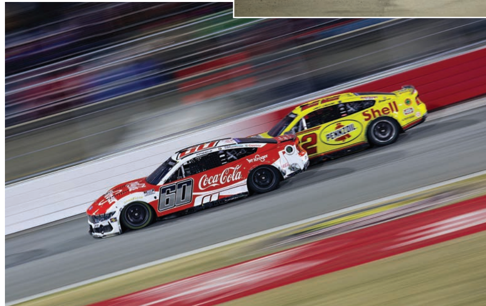
Winner Ryan Preece, driver of the #60 Kroger/Coca-Cola Ford, and Joey Logano, driver of the #22 Shell Pennzoil Ford, race during the Cook Out Clash at Bowman Gray Stadium in Winston Salem, North Carolina on Wednesday.